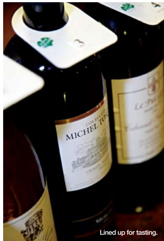
Lined up for tasting.

She admits to an old-world palate — shorthand for a preference for wines that aren't as obvious as overtly fruity, alcohol-driven New World wines. There is real quality to be found in the New World too, though, and a lot of small companies are bringing some excellent Australian wine into Hong Kong.