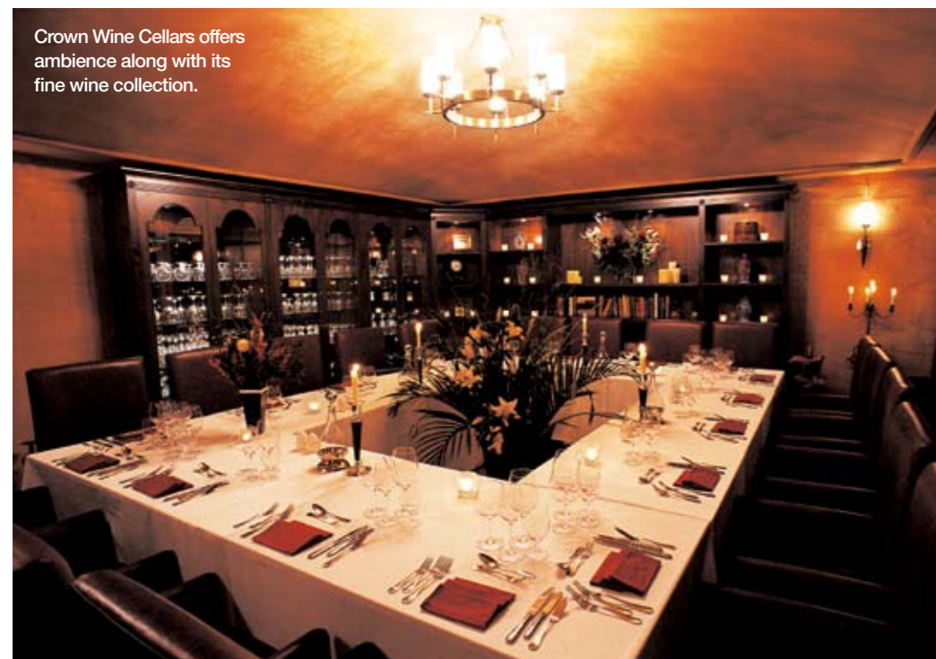
Crown Wine Cellars offers ambience along with its fine wine collection.

With prices now reduced and good-quality wines becoming more affordable, we can expect to see local wine tastings becoming more and more regular events. It is worth remembering though, that the government has warned that the duty reduction is not necessarily permanent. This could be a good time to invest in quality wine, both to drink now and to lay down for the future in Hong Kong. ■